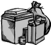
Food Pantry Donations Needed

HELP HUNGRY FAMILIES by supporting the Plum Food Pantry. The goal is to provide food to families and individuals who need it the most and that is where you come in. Some suggestions are: canned soups, canned fruits and vegetables, cold cereal, pasta, peanut butter, tuna, 100% fruit juice, bar soap, disinfecting wipes, diapers, laundry and dish detergents, and shampoo.