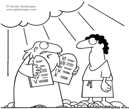
"I downloaded them from a cloud."